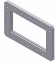
RIGID WAVEGUIDE FLANGE SPECIFICATIONS(CPRF STYLE)